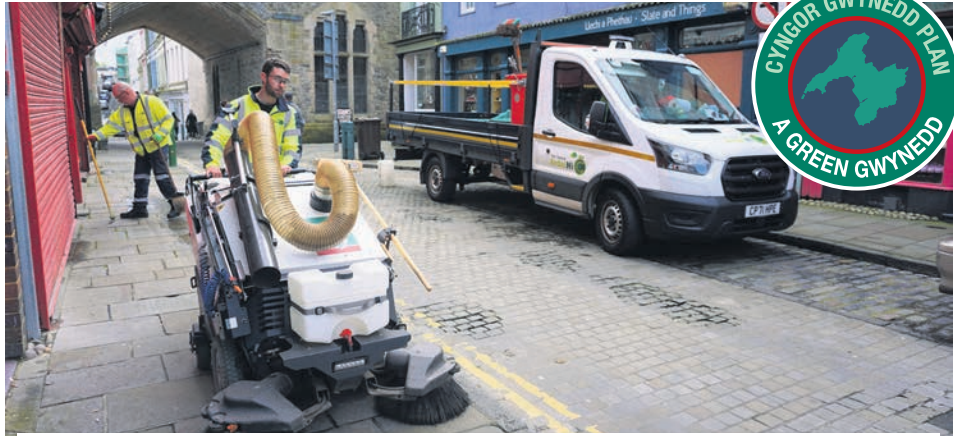
The Tidy-up Teams at work in Caernarfon recently and (left) cleaning up graffiti in Porthmadog.

"Also, our new powerful street sweeper is 100% electric powered, making it green, quiet and very efficient. It can pick up all sizes of litter, from dust, cigarette ends and sweet wrappers, up to drinks bottles and takeaway boxes, leaving our streets spic and span."